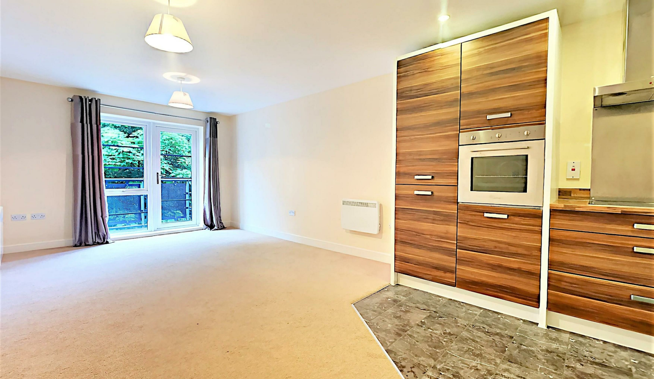
Beverley House, Wallis Square, Farnborough